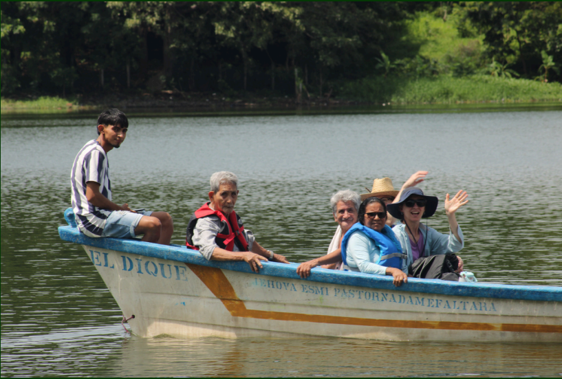
Sister Parish - Expenses 2026